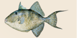
Triggerfish (Gray) ▲●X