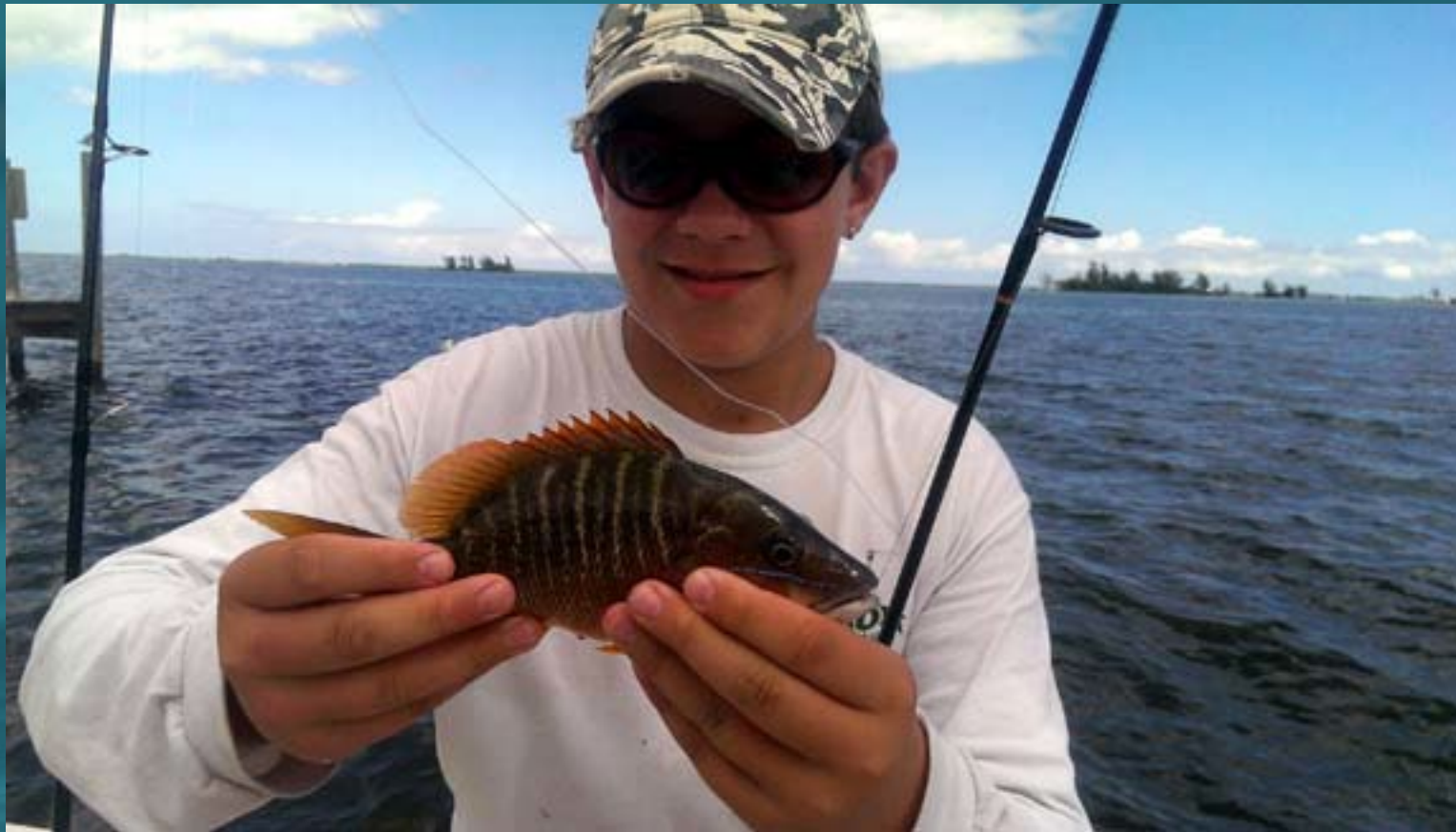
Dog snapper ( Lutjanus jocu ) — live baits, jigs, spoons, feathers, plugs, or pork ring.