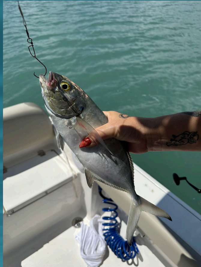
Blue runner ( Caranx crysos ) — Small live and dead bait, small artificial bait